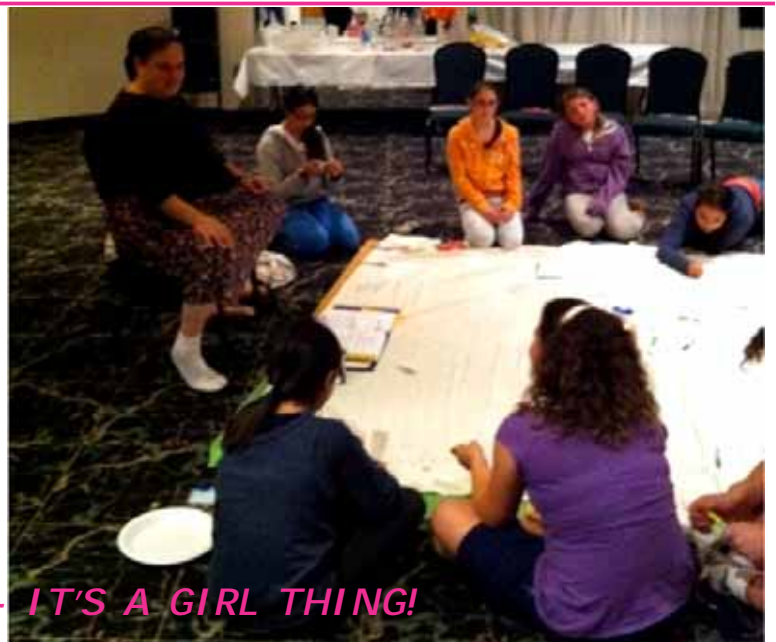
ROSH HODESH - IT'S A GIRL THING!